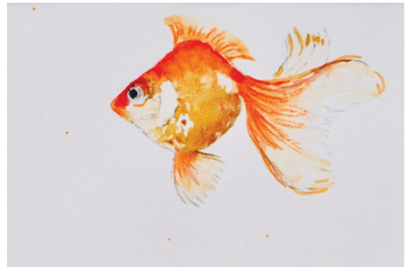
“En suspens” ink on paper 24 x 30 cm