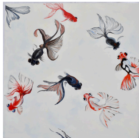
“Finally free!” oil painting on canvas 100 x 100 cm

“The fairy tale of the goldfish who thought he was a sardine” is available in a German and a French version for 20 € on my website.