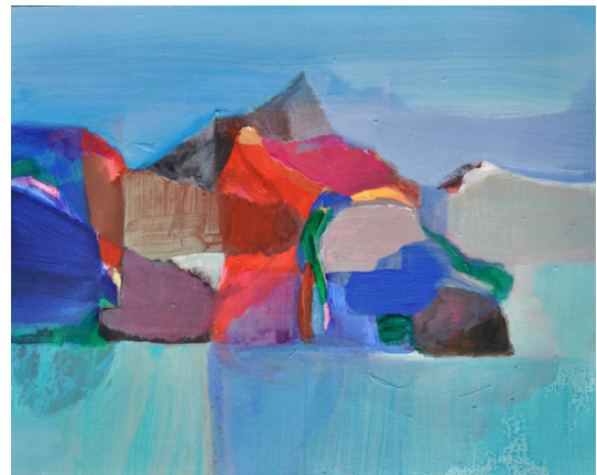
“The coast”, 24 x 30 cm acrylic painting on HDF plate