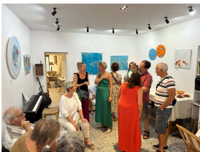
The Raffinerie-Galerie https://www.raffineurs.org