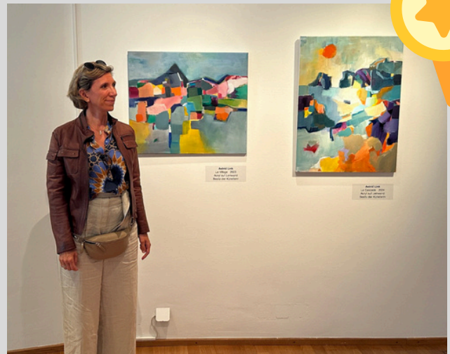
In the Buchheim Museum

Happy to have taken part in the adventure and to see two paintings selected by the Buchheim Museum from among the 250 works by 42 artists for the summer exhibition at the Museum.