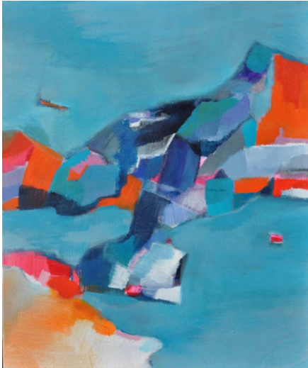
“Côte d’Azur, 50 x 60 cm acrylic painting on canvas

This first solo exhibition was an opportunity for me to offer a retrospective of my work from 2012 to 2024. Bouquets, landscapes inspired by my stays in Brittany and the South of France, and more abstract paintings were also on show.