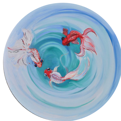
”The other”, 80 cm Diameter oil painting on canvas

What's more, the association offered me a place and an audience to carry out the cultural mediation project around the “tale of the goldfish who thought he was a sardine” that had been close to my heart for years..